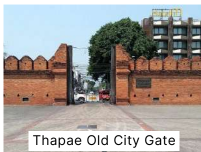
Thapae Old City Gate