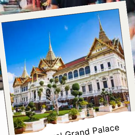
Royal Grand Palace