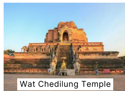
Wat Chedilung Temple