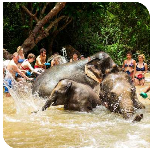
Elephant Jungle Sanctuary