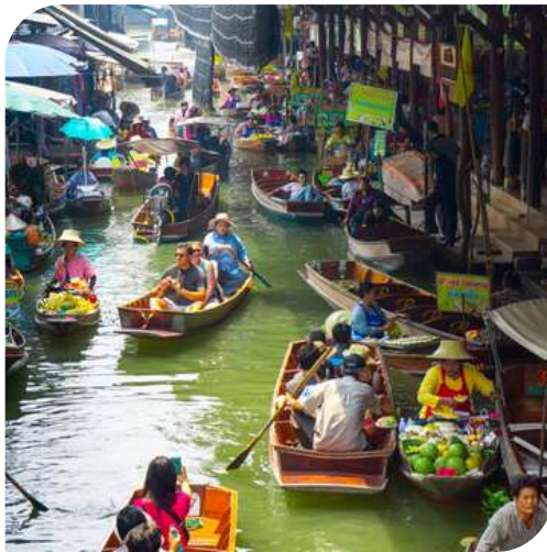
Damnersaduak Floating Market