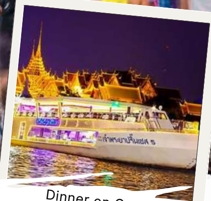
Dinner on Cruise