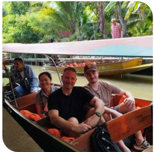
Salt Farm & Coconut farm